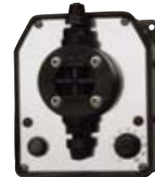
Programmable Digital Control and Accessories

Includes: Pump for addition of Aromatherapy Oils to steam line, 120 volt. Comes with 6-foot, 1/4" suction and discharge hoses, one injection valve, one filter.