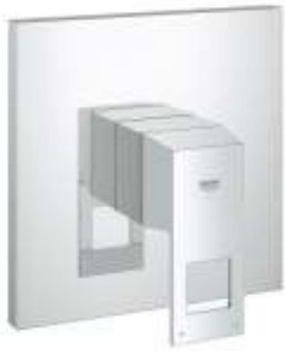
PBV Trimset 19899000 $289