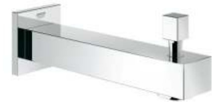
Tub Spout w/ div 13307000 $180