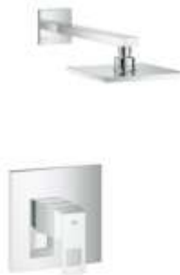
Shower Combo 23148000 $529*