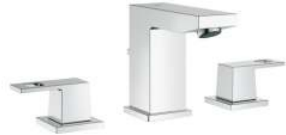
Wideset 20370000 $460