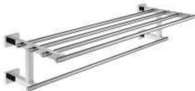
40 512 000 - $252 Multi-towel rack 600mm