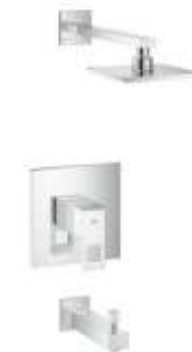
Shower/Tub Combo 35027000 $699*