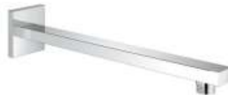
Shower Arm 27710000 $108