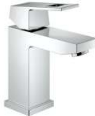
Centerset 23133000 $278