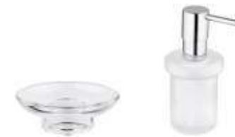
40 368 000 / 40 394 000 Soap dish / dispenser