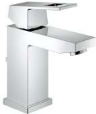
Centerset w/ pop-up 23129000 $298