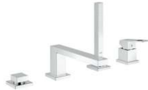
Roman Tub 19897000 $1,400