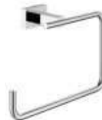
40 510 000 - $139 Towel ring