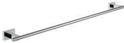
40 509 000 - $139 Towel rail 600mm