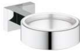
40 508 000 - $55 Holder for soap dish, soap dispenser & glass