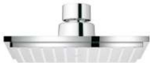
Showerhead 27705000 $185