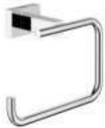
40 507 000 - $110 Toilet roll holder without cover