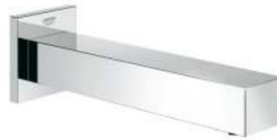
Tub Spout 13305000 $160