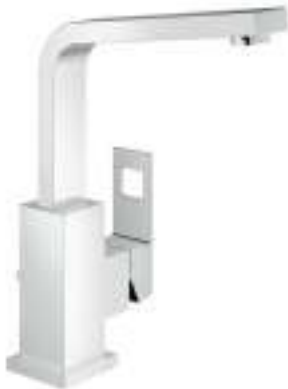
OHM High Spout 23184000 $368