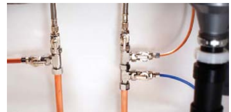
The dahl Way